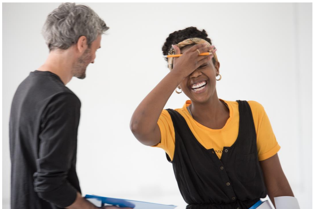
Rehearsals shots